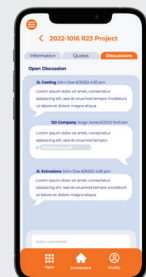
Chat with your suppliers on the go with the mobile app.