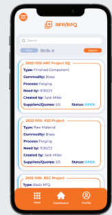
View all your RFQs in one place on your mobile device.